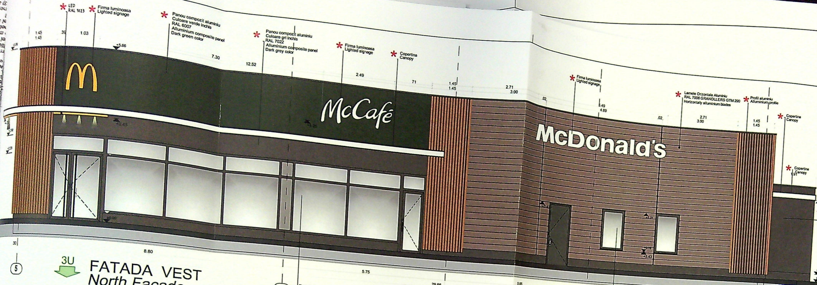
3U FATADA VEST North Facade

PROIECTUL DE VIZAT SPRE MECTHIA CRAIOVA Nr. 254 Arhitect